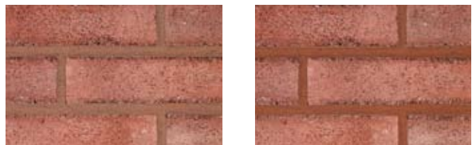
(c) Different shade, same hue and intensity

Fig. 1. Color can be classified on the basis of three variables: hue, intensity, and shade as illustrated by these examples in which two of the variables are held constant while two distinct levels were selected for the third variable.