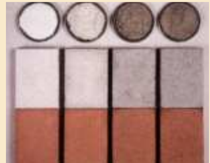
7. Variations in the color of portland cement (top) obtained from different manufacturers will affect the shade of both plain (middle) and colored concrete (bottom).