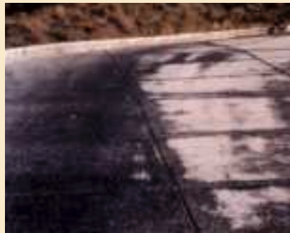
6. Carbon black pigments can leach out of concrete in wet areas unless adequately sealed.