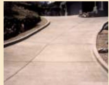
21. After curing. Concrete lightens as it cures. Most change occurs within 30 days.