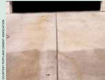
9. Concrete from two batches was used here in adjacent pours. The darker concrete in the foreground was discolored by a calcium chloride admixture.