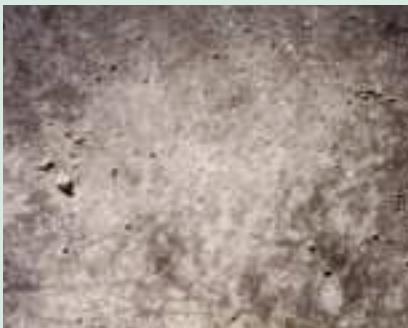
16. Excessive use of form release agents can contribute to discoloration and voids in a formed concrete surface.

Concrete producers must protect against contamination of a concrete batch with material left in a mixer from a previous batch. It is a good practice to wash out the mixer between incompatible batches, especially between batches of differing colors. Pay attention to the scheduling of deliveries, placing, and finishing. Once again, uniformity is key to consistency. To the extent practical, all concrete placement should be performed under similar environmental conditions. Concrete placed during the hottest periods of the day or under windy conditions may begin drying prematurely and affect the uniformity of the finish.