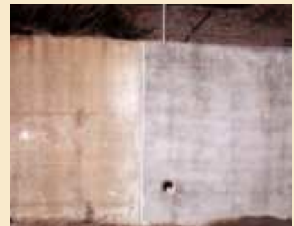
22. These stains could have been avoided by diverting runoff from the concrete face.

DAVIS COLORS Setting the Standard for Concrete Colors