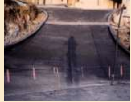
20. Before curing.

Surface Defects in Concrete , a reprint collection from Concrete Construction , Aberdeen Group Publication 3910.