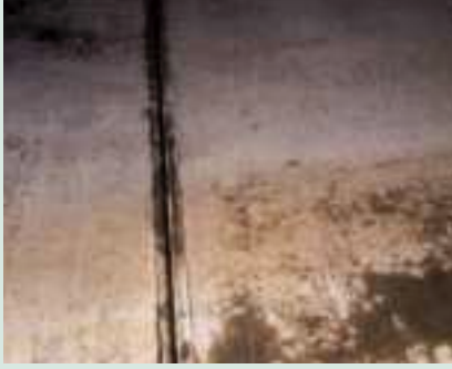
13. Over troweling can entrap moisture and create dark areas.