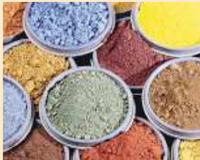
5. Concrete colors should be obtained from a manufacturer with strict quality assurance procedures and a fully equipped color laboratory.

PHOTOS COURTESY DAVIS COLORS UNLESS OTHERWISE INDICATED