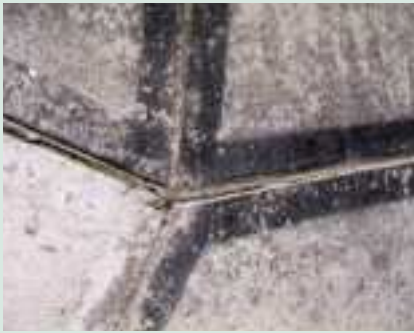
14. Edging work, performed after the concrete began to harden, is the likely cause of this discoloration.