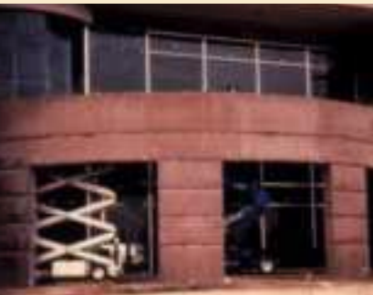
17. Before sandblasting.

A spray-, lambswool-, or roller-applied membrane curing compound specifically designed for colored concrete will achieve the best results. The curing compounds should be applied evenly and as soon after the initial set as the concrete can be walked on without harming the surface. Clear compounds allow the natural color of the concrete to show. Tinted com-