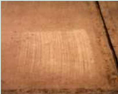
15. The pale broom mark, which is permanent, shows the first broom stroke after the broom was wetted.