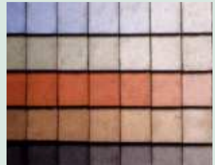
10. A range of hues can be created by changing the color additive dosage rate.