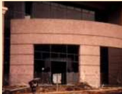
18. After sandblasting. A more uniform color was revealed after the cast-in-place wall was fully cured and sandblasted.