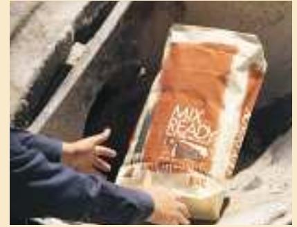
11. Disintegrating bags of color additives can be tossed into a mixer without opening or pouring.

Adding water has other negative effects on concrete. Too much water contributes to dusting, cracking, and reduced durability of the concrete surface. Adding 3.8 L (1 gal) of water per 0.76 m 3 (1 yd 3 ) of a properly designed mix creates an additional 25 mm (1 in.) of slump, reduces compressive strength approximately 1380 kPa (200 psi), increases shrinkage by 10 percent, and increases the potential for efflorescence.