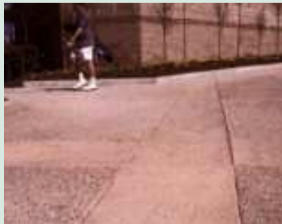
8. While exposed aggregate was used in this project as a design feature, a similar effect can occur due to wear and erosion.