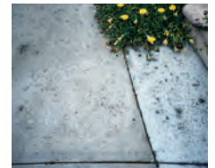
Cement Color Varies