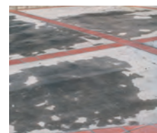
Poor Subgrade Quality