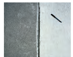
Old vs. New