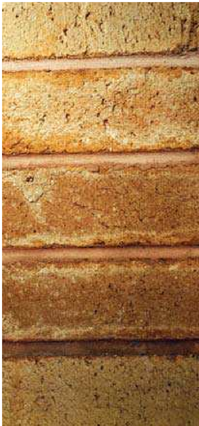
Fig. 3. In this example, a masonry prism was constructed using one batch of mortar. The top mortar joint was tooled immediately after placement of the unit. Remaining mortar joints were tooled at progressively greater time intervals and thus stiffer consistency. The relationship between mortar consistency when tooled and mortar color is quite apparent.

The effect of tooling on the appearance of a mortar joint is dependent on the type of jointer used and the stiffness of the mortar at the time it is tooled. Tooling of mortar when it is highly plastic or flowable will tend to pull a high-water-content paste to the surface, resulting in a porous light-colored joint surface. If the mortar is allowed to become stiff before tooling, the joint surface will not readily yield to the pressure of the jointer, and friction developing between the metal jointer and the mortar joint will result in a dark streaked surface. When tooled at the proper consistency, the surface of the mortar joint is compacted, and a uniform appearance consistent with the body of the mortar is achieved.