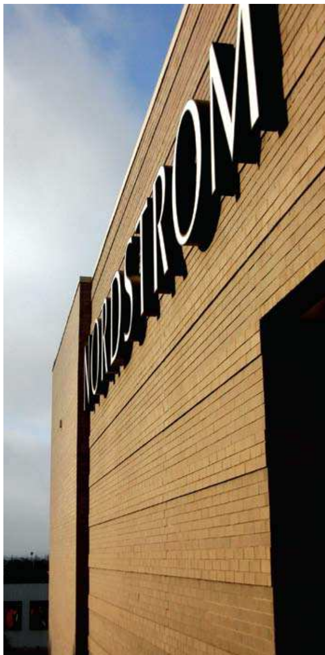
Fig. 6. With care and cooperation, consistent mortar color producing the appearance desired by the owner can be achieved.

View with Pride. It was noted at the beginning of this article that an appreciation for the inherent beauty of masonry is often the reason it is selected by the owner as a building component. Hopefully, that appreciation of masonry is shared by the mason contractor and his crew and will motivate each person to do his part to assure that the finished project is one in which all can take pride.