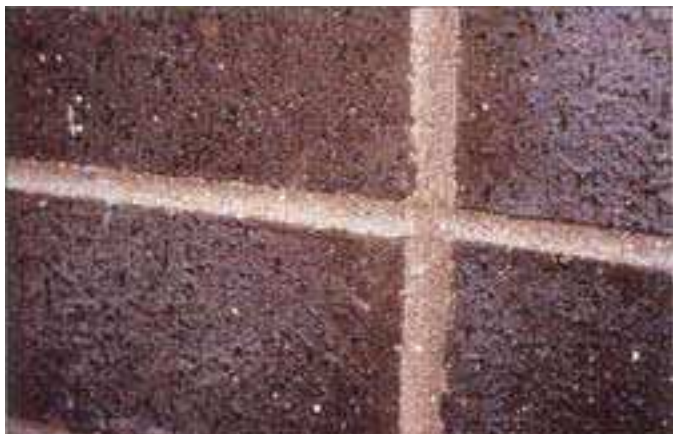
Fig. 4. The use of a strong acid cleaning solution has etched the surface of these mortar joints, exposed sand particles, and significantly changed the appearance of the mortar joint.

Cleaning. Cleaning procedures often completely alter the appearance of a mortar joint, changing both texture and color. Most cleaning techniques are designed to remove mortar droppings or smears from the surface of newly constructed masonry. However, if these techniques dissolve the cement paste from the surface of a mortar joint, the appearance of that joint is no longer dominated by the color of the hardened cement paste, but reflects the appearance of sand particles that are exposed on the surface. The effect of improper cleaning is most dramatic on colored mortar joints, since the pigmented cement paste is relied upon in these systems to produce the desired color. In addition to altering the appearance of mortar joints, improper cleaning may damage masonry units and compromise the ability of the masonry to resist water penetration.