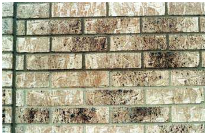
Fig. 5. The difference in mortar color in this example was determined to be the result of a change in both sand and type of cement used in the mortar.

Use the Same Mortar Materials. Changes in brands of masonry cement, mortar cement, portland cement, hydrated lime, or pigments during construction of a project should be avoided. All of the sand should be from the same source. When multiple sand shipments are required, the mason contractor should visually check the appearance of successive shipments to assure that sand color and gradation has not changed significantly. For jobs having particularly demanding requirements on mortar color, it may be advisable to keep a small quantity of sand from the first shipment in a sealed container for comparison with subsequent shipments.