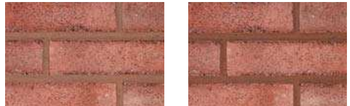
(b) Different intensities, same hue and shade