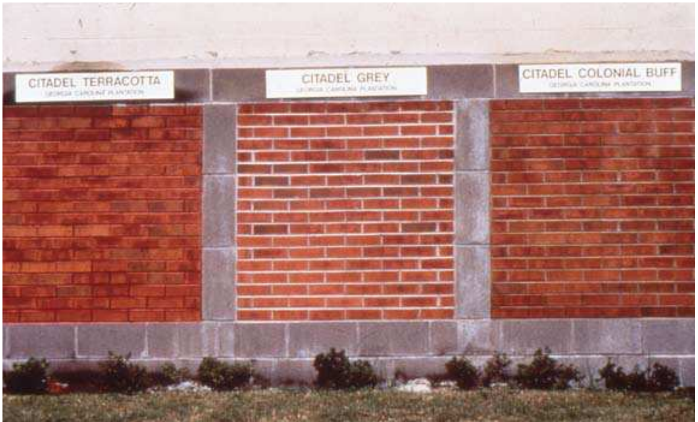
Fig. 2. These panels are constructed with the same brick and different colored mortars illustrating the effect mortar color can have on the overall appearance of masonry.